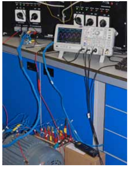
Testing of a five-phase machine in open-end winding configuration with dual inverter supply.

Research in the area of electric machines and drives commenced at the Liverpool John Moores University in 1992. Located in the Faculty of Engineering and Technology, the Institute is situated in a vibrant and historic port city of Liverpool and operates under the auspices of the Research Centre for Electrical and Electronic Engineering. The research is conducted by three full-time academics, and, typically, five to ten PhD students and post-doctoral research associates. Visiting scholars from predominantly EU Universities are regularly hosted (on average, three per calendar year).