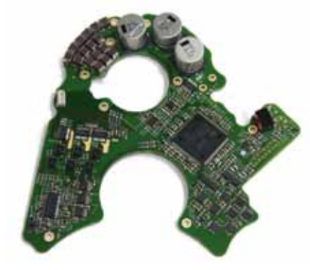
Inverter board for direct integration on Pedelec