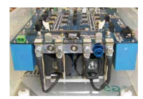
Highly efficient and compact three-phase fast battery charger (5kW/L with low-cost standard semiconductor devices within ECPE Project)