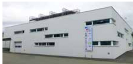
New laboratory building.

A significant part of the research activities is carried out in cooperation with national and international industrial partners, covering the areas of electro-mechanical as well as solid-state power converters, design of power-electronics based systems including control and interactions between system components, and the development of prototypes and experimental verification in the institute's own laboratories. With activities both in the area of power electronics and in the field of electric machines, the institute is ideally placed to work on questions that arise from power electronics to electric drive systems applications.