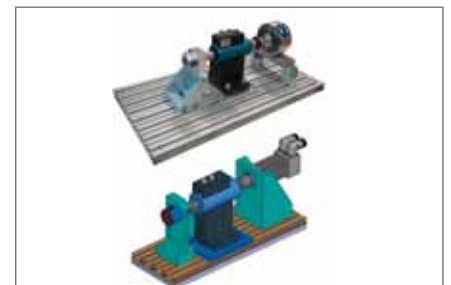
Test rig for fractional horsepower drives (Mechatronic Systems GmbH, Wies).

Examples for current research projects cover the wide range of topics from starting of a line-operated synchronous machine with damper winding to the electric and thermal design of drives for electric traction applications, and small low-cost drives of a few hundred Watts rated power for mass production. Further activities include motor-inverter interactions, such as inverter-induced bearing currents, and the development of new power converter topologies, such as a power supply reaching titanium level efficiency for a wide range of input voltages.