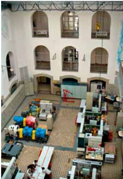
Fig. 1: Test stands of the Chair of Electrical Machines and Drives for research and education

The Chair of Electrical Machines and Drives is a part of the Institute of Electrical Power Engineering which was founded in 1894. The students taught in the institute belong to the study branches "Electrical Power Engineering" and "Mechatronics". The research work of the chair is to make substantial contributions to the fundamental and applied research for efficient energy transducer systems, generators and electrical drives. In addition count both linear and rotating machines and line-side and motors-side inverters and their control (Fig. 1).