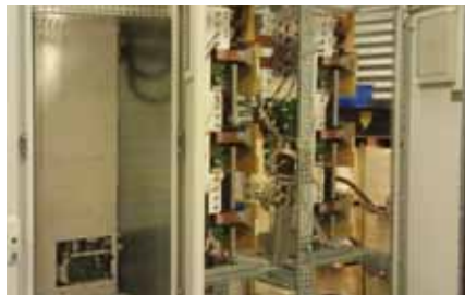
1 MVA power stack. IGBT modules.

The power electronics research at Aalborg University places great emphasis on national and international collaborations with peer universities and companies. A recent example is the establishment of two strategic research centers, the Center of Reliable Power Electronics (CORPE, www.corpe.et.aau.dk ) and Intelligent and Efficient Power Electronics (IEPE, www.iepe.et.aau.dk ), in collaboration with Danfoss, Grundfos, KK Wind Solutions, and Vestas, with a research budget of 25 million Euros.