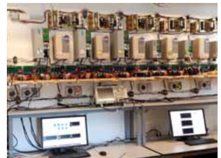
Multiple power electronics converters based energy processing system.