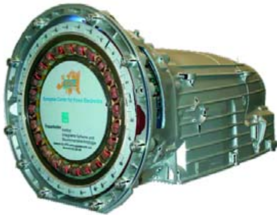
Figure 1: Electric drive with the power electronics, both integrated into the clutch-box of a car.

The ECPE research activities funded by the ECPE partner industries is focussing at so-called demonstrator projects where new ambitious power electronic systems or sub-systems are developed and realized by leading European Competence Centers. This article describes results of the "System Integrated Drive for Hybrid Traction in Automotive" Demonstrator Programme performed by the Fraunhofer Institute of Integrated Systems and Device Technology (IISB) in Erlangen/Germany.