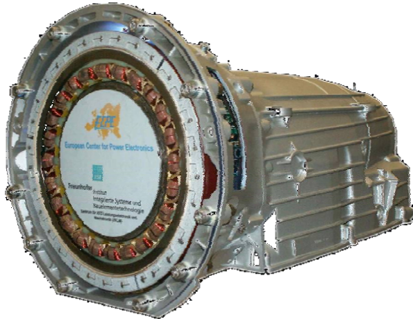
Fig. 1: Electric drive with the power electronics, both integrated into the clutch-box of a car. The picture shows the drive unit screwed at the gear-box.